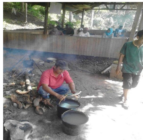
Figure 3. Preparation of liquid fertilizer for plant nutrition