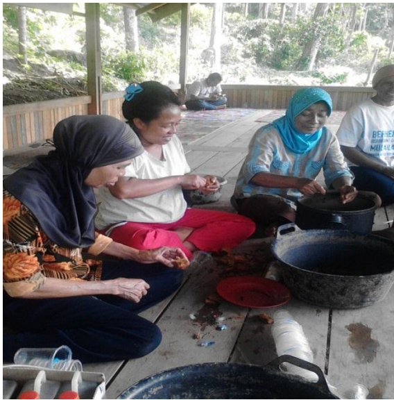
Figure 4. Planting vegetable seedlings in the planting medium