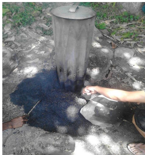
Figure 2. Results are ready husk ash as a growing medium