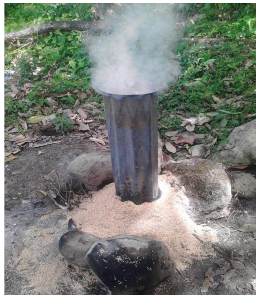
Figure 1. Preparation of planting medium husk ash

Activities already carried out is to start preparation, socialization and the practice of planting vegetable cultivation media preparation hydroponic systems to the application field. The documentation of the manufacturing plant media hydroponic system up to planting vegetables using bamboo installation as shown below.