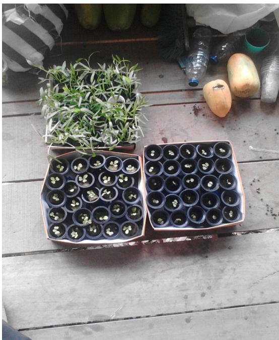
Figure 5. Vegetable seedlings kale, collards and caisin who are ready to plant