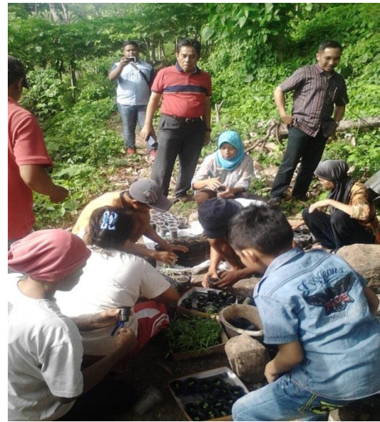
Figure 6. The setup process media for the cultivation of vegetable seedlings