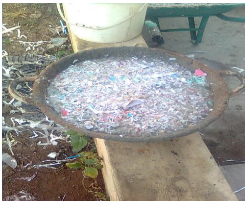
Soaking of paper in water for 24hours