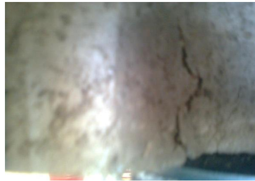
The total failure of the IDRT cube test