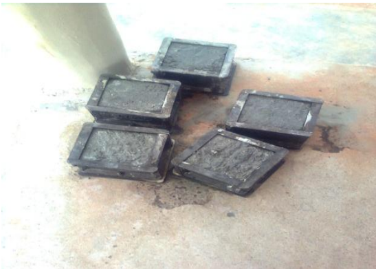
Casting the IDRT Mix Cubes