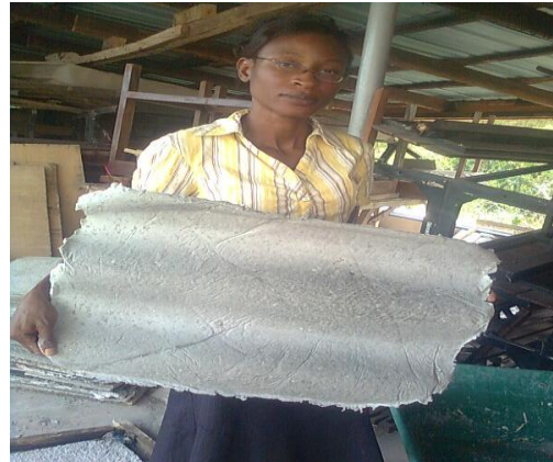
Moving of the vibrated motar to mold