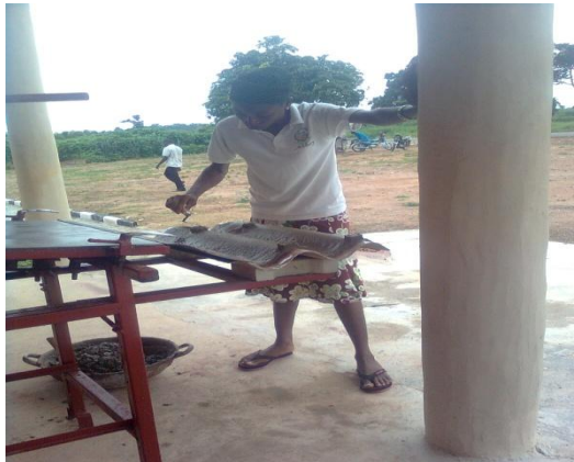
Dressing of the motar on Vibrating Table