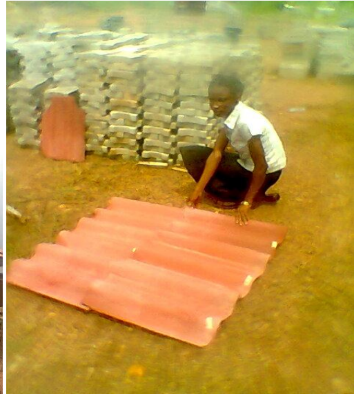
6No IDRT = One Square Metre of Roofing Area