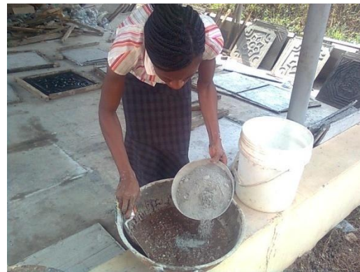
Mixing of sharpsand, with cement