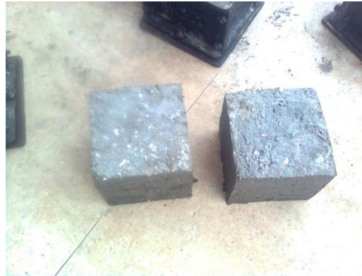
De-molding of IDRT Mix cubes after 24hours