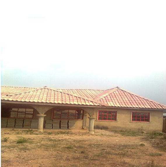
Picture illustrating actual field Application of Concrete Roman Tiles Technology