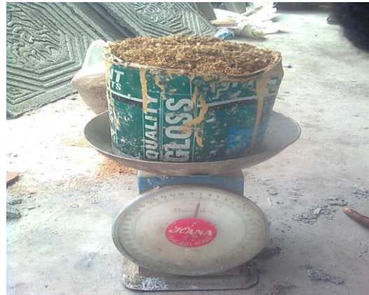
Measuring of Sawdust