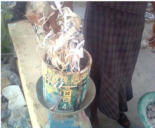
Measuring of paper