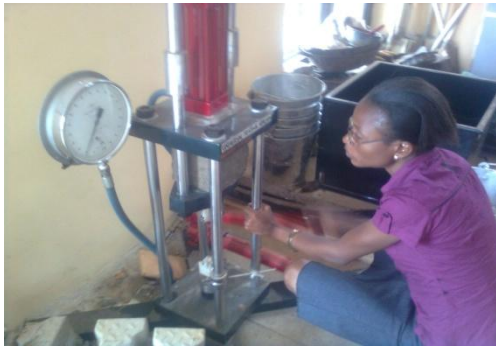
Operating the Universal Testing Machine