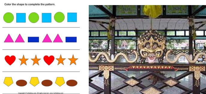
Fig. 4 Learning resources for pattern and one dimensional shape