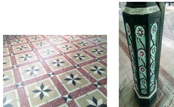
Fig. 3 Learning resources for tessellation