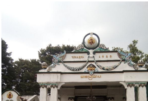
Fig.6. Learning resources for shape combination