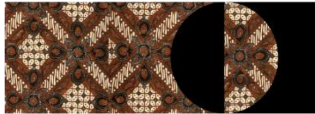
Fig. 2. Batik ceplok kopi pecah: area learning resources with traditional optional subject