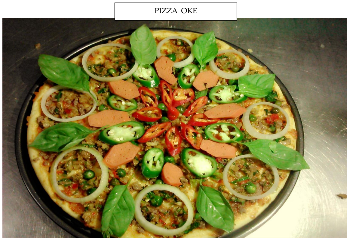
Picture 3. Seasoning of oncom and topping ingredients