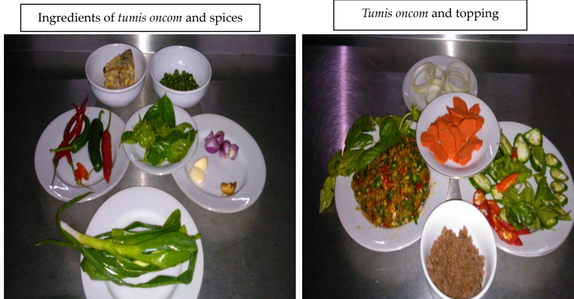
Picture 2. Seasoning of oncom and topping ingredients